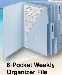
6-Pocket Weekly Organizer File